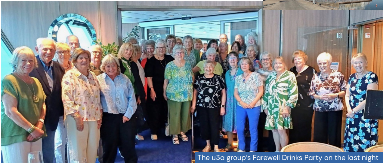
The u3a group's Farewell Drinks Party on the last night

At the northernmost tip of Denmark, a tractor-drawn 'bus' took us to the dramatic meeting of the North Sea and the Baltic.