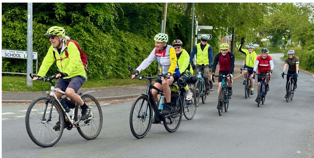
The group on the move near Antrobus, Cheshire

The Cycling Group are taking advantage of the Spring weather to ride most Fridays at the moment.