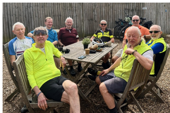
Relaxing at Riverside Organic Farm